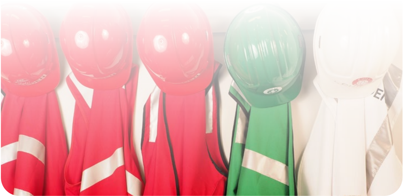
RELEASED JANUARY 2023 REVIEW - 6 MONTHS

Just Careers Training has a fair and transparent complaints and appeals policy. All complaints will be dealt with in a timely manner and avenues for appeals extend to third party arbitration. Your Participant Handbook contains more information.